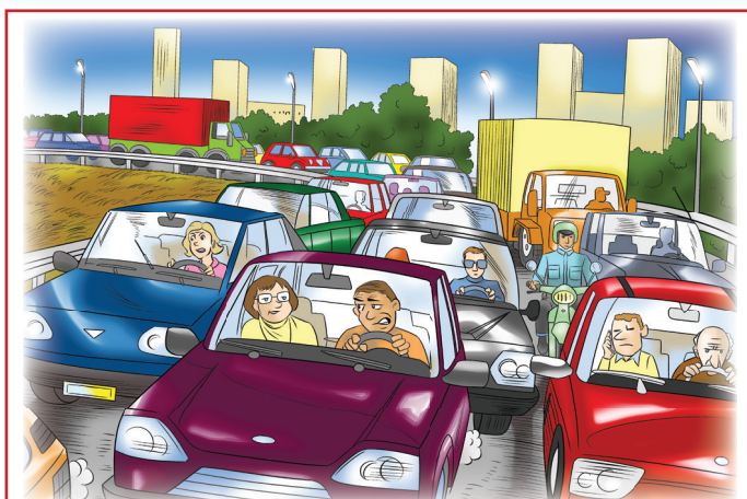
"Ever wonder why they call this the RUSH HOUR?"